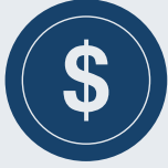
Business & Financial Services