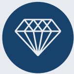
Minerals & Mining