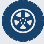
Automotive, Transportation & Logistics