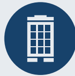
Environment & Building Technologies