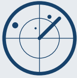
Aerospace, Defense & Security