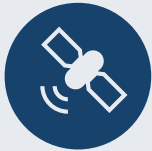
Information & Communication Technologies