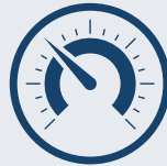
Measurement & Instrumentation