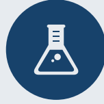
Chemicals, Materials & Food