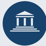
Public Sector & Government